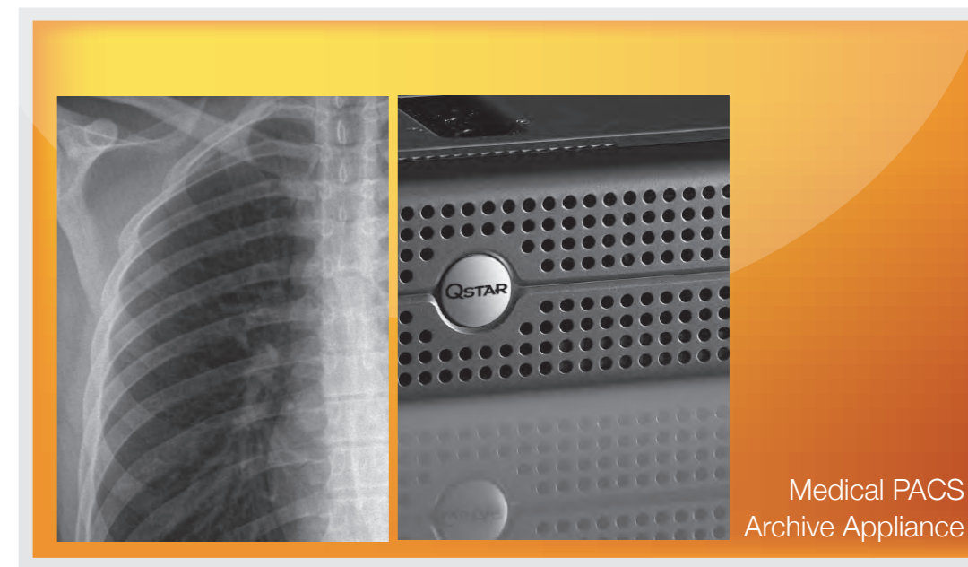
Medical PACS Archive Appliance

With SntrypACSTM, the actual capture process for any radiology instrument doesn't change. Digital images from all the modalities are captured and directly pushed into the integrated SntrypACSTM DICOM server; in addition, non-DICOM images can be converted to be stored in DICOM on the archive server. SntrypACSTM has an independent work list module of its own, but can also plug into an existing hospital information system.